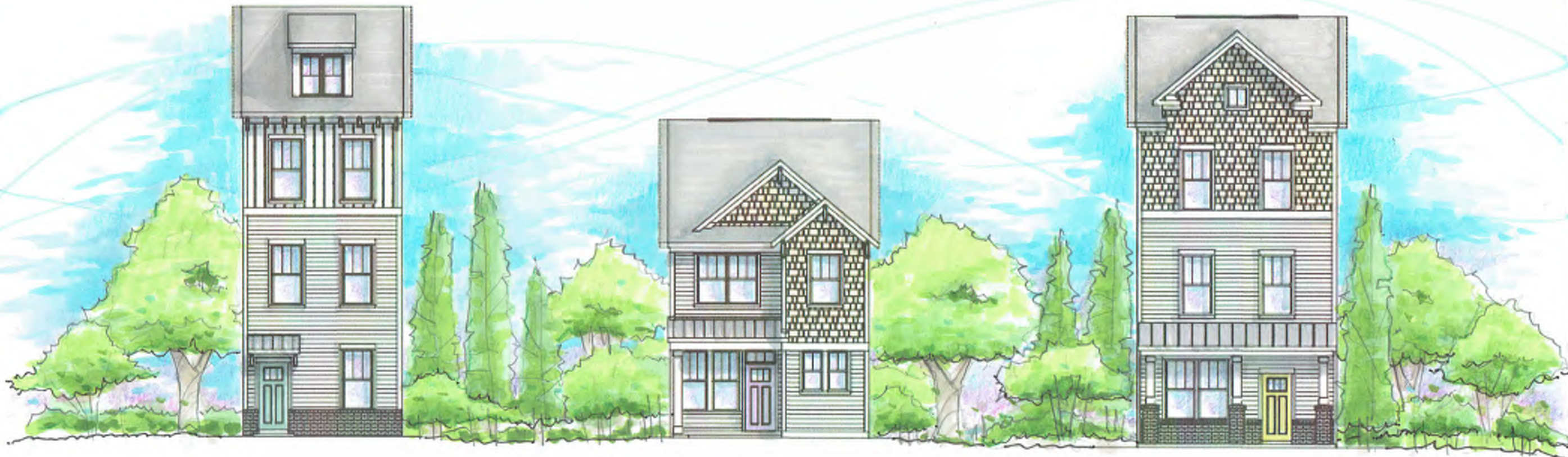
HENLEY II ELEVATION I SCALE: 3/8" = 1'-0"