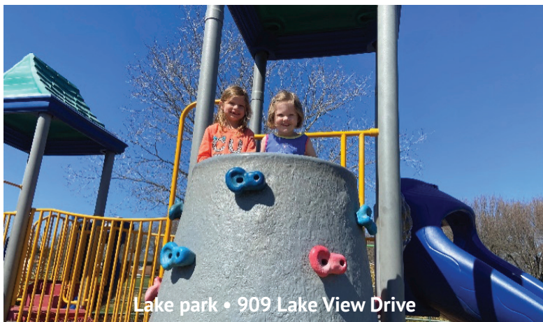
Lake park • 909 Lake View Drive