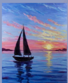
Mon. July. 14th 5:30pm

Cost: $15 Pineville Resident/$20 Non-Resident