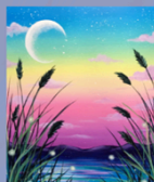
Mon. Aug. 11th 5:30pm