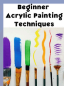
Mon. Sept. 15th 5:30pm